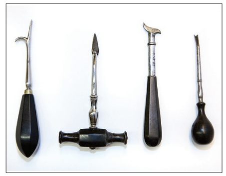
Fig. 1 Examples of early elevators.

Sir, we would like to express our enjoyment of Bussell and Graham's article, The history of commonly used dental eleva tors (BDJ 2008; 205: 505-508 – see Fig. 1) and to elaborate a little on the history of these instruments, before Albucasis. The De Medicina of Aulus Cornelius Celsus (c. 25 BC – 50 AD) was one of the most widely regarded medical texts of the later Classical world and continued to be considered as essential reading for medical professionals into the Early Modern period (post 1500 AD). Celsus described an operation which would require the use of an elevator: 'But if a