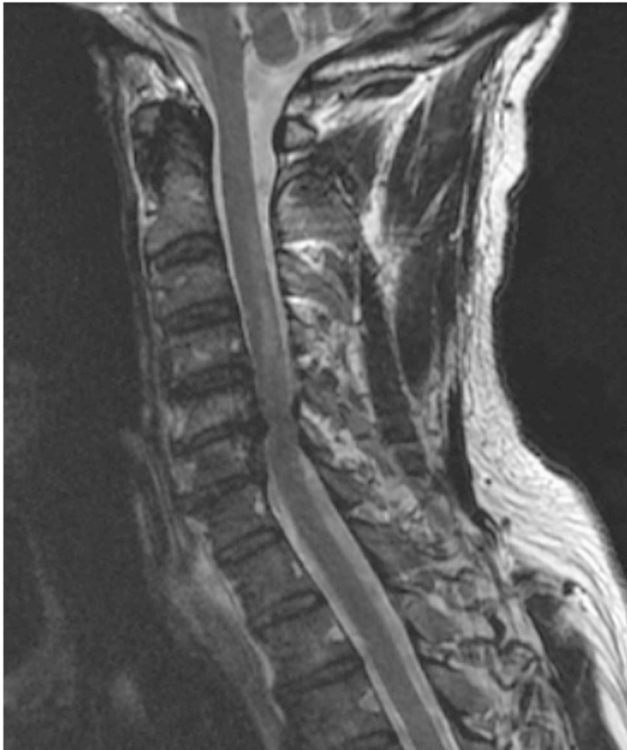
Figure 2 48-year-old male diver with spinal cord decompression sickness. Sagittal T2-weighted MR image reveals grade 2 cervical canal stenosis at C5-C6 level and hyperintense signal involving the posterior part of the cervical spine from C2 to the caudal C4 level.