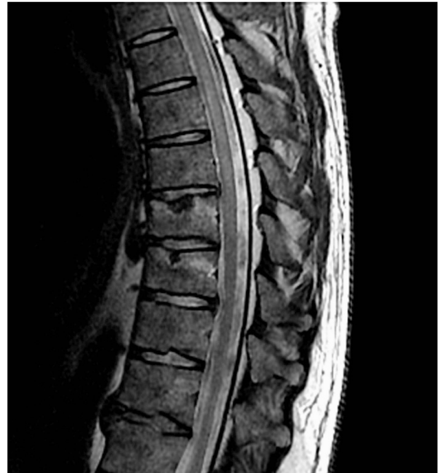
Figure 3 41-year-old male diver with spinal cord decompression sickness. Sagittal T2-weighted MR image showing hyperintense signal involving the thoracic spine from caudal T3 to T5 level. Spinal canal is narrow at T5-T6 level and T8-T9 (grade 2 stenosis). Note the Schmorl's nodes in the body of T7 and T8 with surrounding high signal intensity indicating the presence of oedema in the vertebral bone marrow. Close questioning of the patient revealed a previous history of thoracic trauma several years ago.

compromise spinal cord vascularisation and may increase strain and shear forces applied on the spine, causing arterial hypoperfusion and impairment of venous outflow in the epidural venous system. These ischemic conditions may promote the accumulation of nitrogen bubbles in situ , but also initiate a complex cascade of biomolecular changes, including release of inflammatory mediators, excitotoxicity and apoptosis, finally leading to demyelination, gliosis and necrosis, as already described in the myelopathy of cervical spondylosis. 17