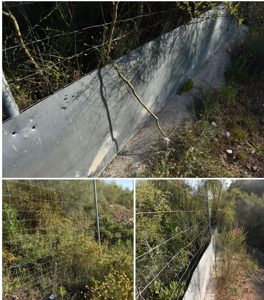
Figure 2. Top image: reptile fence. Left image: chain link fence without metal sheet. Right image: reptile fence with vegetation around it.

species is found only within a small distribution range in southern Spain and Portugal. Although the species may have been introduced to Iberian Peninsula from northern Africa in prehistoric or and historical times 23 , since the Spanish populations are morphologically indistinguishable from those of northern Africa 24 , individuals of the species are not allowed to be killed nor their breeding sites or resting places disturbed. The common chameleon is included in Annex IV of the EU Habitat and Species Directive (92/43/CE) as a species of interest and is strictly protected in Annex II of the Bern Convention. In Spain, mortality caused by collision with vehicles is one of the main threats to the species 25–27 .