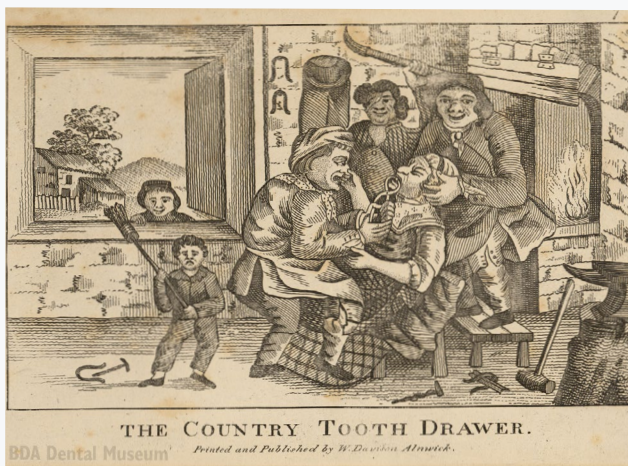
Fig. 5 W. Davison of Alnwick. 'The Country Tooth Drawer'