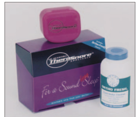
Reader response number 77

Distar, manufacturer of Adjustable TheraSnore anti-snoring appliance has recently announced the product is now available in different sizes. The Adjustable TheraSnore treats mild to moderate sleep apnea as well as simple snoring. The new sizes will still be fitted in the surgery in 30 minutes or less without the need of any models, impressions or laboratories and are still adjustable in precise 1.5mm increments with out the need to refit the appliance. Distar will be exhibiting at stand C13.