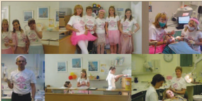
The team undertook many fund raising activities

In the evening five members of the dental team were invited to join the audience at the BBC studio in Glasgow.