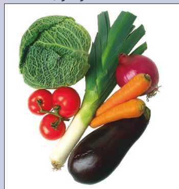
Are some drugs incompatible with a vegetarian diet?