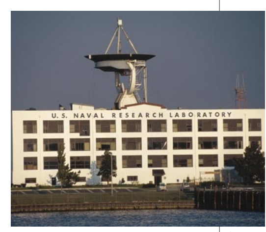
All at sea? The Navy's research laboratory has faced problems attracting young staff.

To try to fix matters, Congress has repeatedly legislated to create pilot programmes that allow the Pentagon to streamline hiring and give the labs more salary flexibility. The senators also asked for laboratory directors