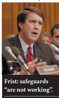
Frist: safeguards "are not working".