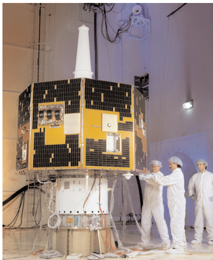
Delayed exposure: IMAGE is having to wait to study Earth's response to solar magnetic activity.

A key assumption behind the 'better, faster, cheaper' approach adopted by NASA is that it dispenses with much of the red tape and bureaucratic requirements of past