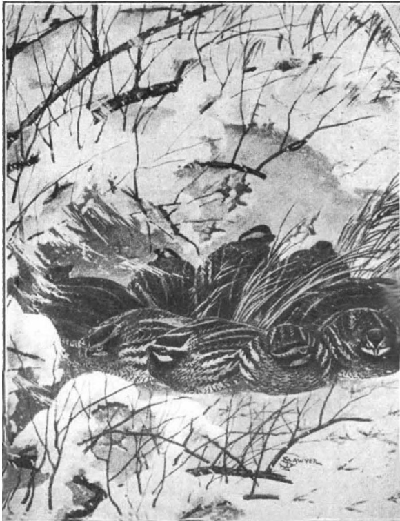
A Bevy of Californian Quail. From U.S. Educational Leaflet."

Among several "Educational Leaflets" received from the American National Association of Audubon Societies, reference may be made to the so-called Virginian quail, or "Bob White" ( Colinus virginianus ), a bevy of which forms the subject of the illustration here reproduced. The