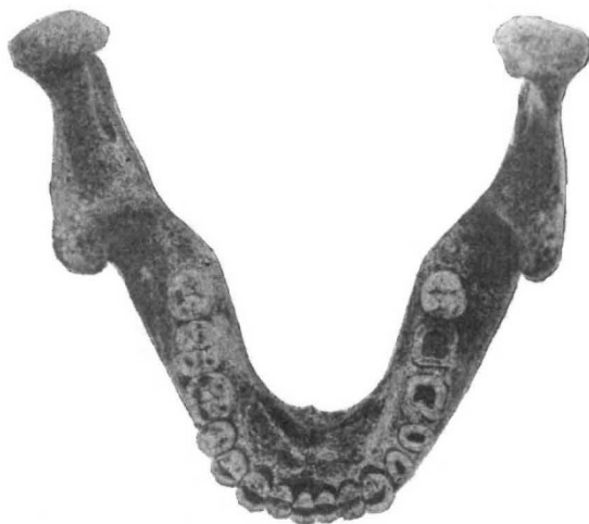
FIG. 2.—Mandible seen from above.

When found, the two parts were thickly coated by the deposit in which they lay; the left half had a piece of limestone firmly cemented to it, both jaw and stone being similarly marked by dendritic deposits of iron and manganese. The sand in which the jaw