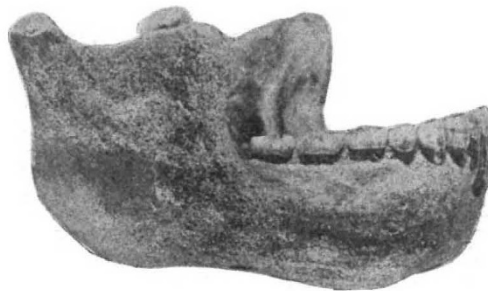
FIG. 1.—Mandible seen from the side.

THE oldest remains of Man with which, until now, we were acquainted date back to the middle Pleistocene, to the Moustier period. They are represented by the cave relics from Neanderthal, Spy, Krapina, Naulette, Malarnaud, and possibly Mentone, by the drift relics from Galley Hill and Bury St. Edmunds. In the memoir under notice, however, we have the description of the two halves of a lower jaw for which a much higher antiquity is claimed.