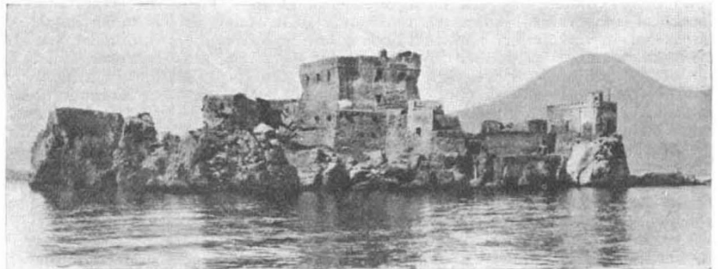
FIG. 2.—Revigliano from the south-east.

The granitoid and Filonian Rocks of Sardinia form the subject of a posthumous memoir of Carlo Riva (No. 9, 108 pp., 7 pls.), which has been prepared for the press by his friend and colleague Prof. de Lorenzo. After describing the petrographical characteristics of the chief varieties of rock in detail, the author gives a valuable account of seventeen localities in Sardinia where zones of contact between the granites and schists and calcareous rocks may be well studied, together with an appreciation of the meta-