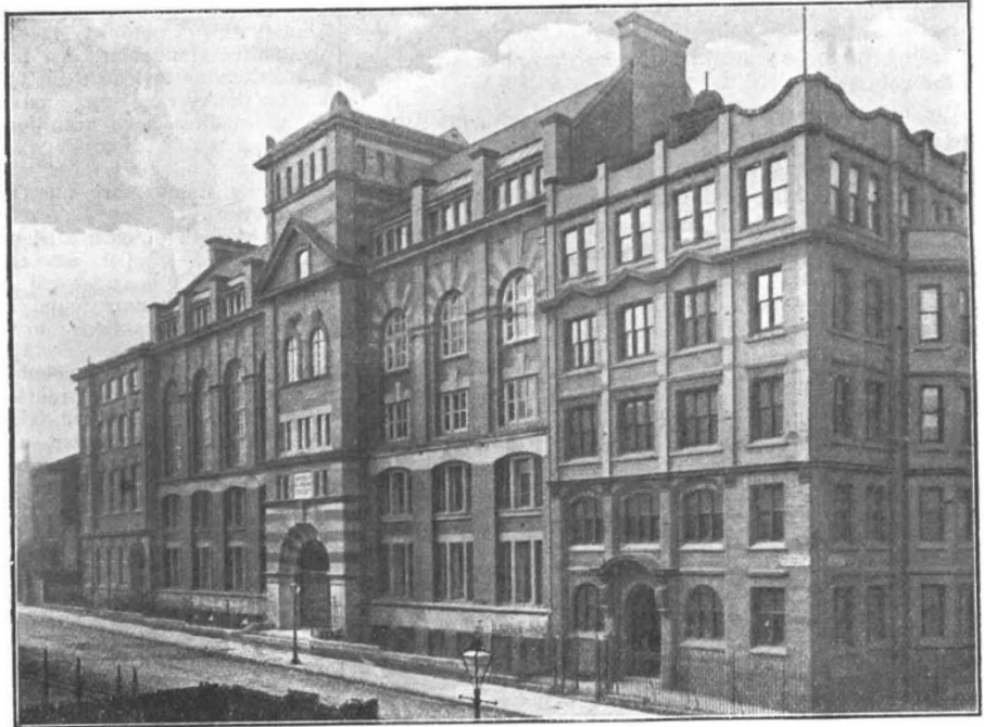
FIG. 1.—New Buildings of the Department of Zoology, University of Liverpool.

done by associating his name either with a university or with a chair in that university, or by some other great benefaction. The result was that the United States had rich universities, such as that of Cornell, founded by individuals, and he confessed that if he were a man of great wealth he would much rather posterity would remember him as having founded a university or a chair of a university than as having been a liberal subscriber to the funds of his party. Though a good understanding existed between this country and other Great Powers, provision should be made for the war in commercial supremacy. What were the armaments with which we were to provide ourselves for the purposes of defence in the war of commercial supremacy? They were those provided by science and by scientific research. Fortunately for us, the inventions of science could not be patented in the interests of any one particular country, but the slightest improvement upon them could, and it was those improvements, arrived at by scientific research, which would make or mar the supremacy of any country in commerce. The power of adding to a train-load that could be carried by a locomotive in the other hemisphere might make a differ-