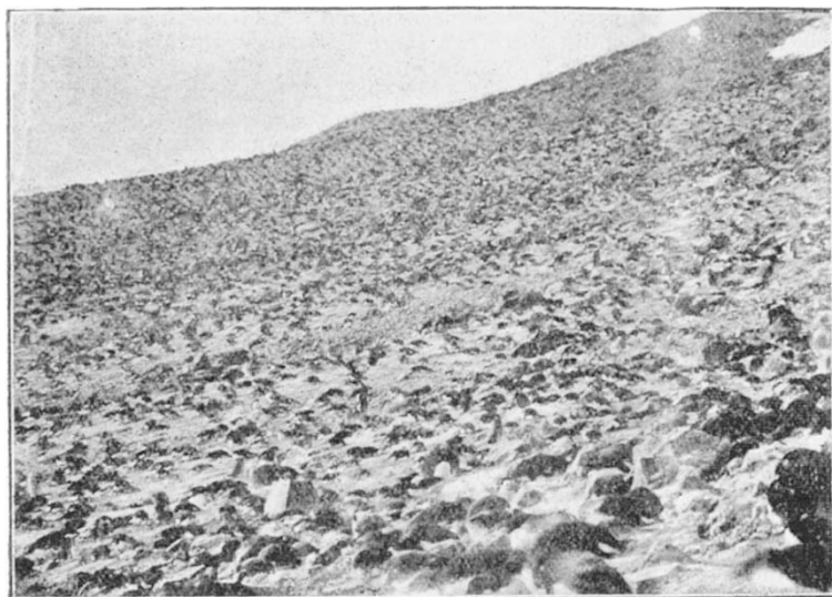
FIG. 1.—Adelia Penguins on their Nests.

BY the issue of the handsome and beautifully illustrated volume standing first on our list, the Trustees of the British Museum have followed the lead set a couple of years ago by the appearance of the "Monograph of Christmas Island," and have thus added a second work describing the fauna of a definite area to the long list of publications bearing their name on the title-page. And there can be little doubt that this new departure will be welcomed by naturalists and by the public at large. In the present instance it has afforded a means of commemorating in a graceful and fitting manner the munificence and generosity of the originator of the Southern Cross expedition, and has likewise furnished zoological science with a valuable memoir on the fauna, flora and petrology of the Antarctic. How valuable such a publication is at the present time needs no comment here; and it will accordingly suffice to say that with the "Antarctic Manual" and the present volume