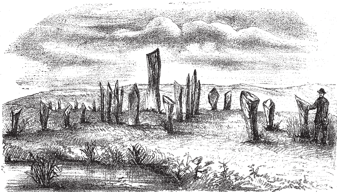
View from North-East.

limbs is placed the largest stone, whilst around is a circle of tall stones. The stones are rough, and appear only to have received such dressing as would bring them to a suitable shape for erection; they are composed of the rock of the island, the Laurentian gneiss, which, in geo-