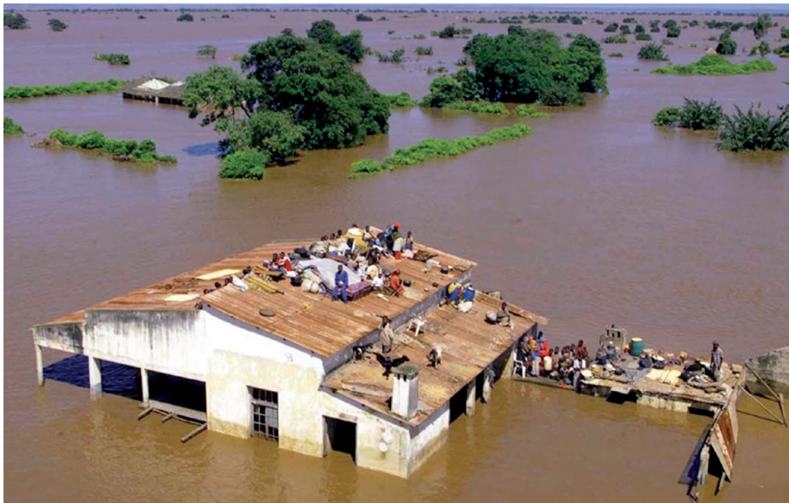
Flood victims wait to be airlifted from a home near the mouth of the Limpopo River in Mozambique last year.