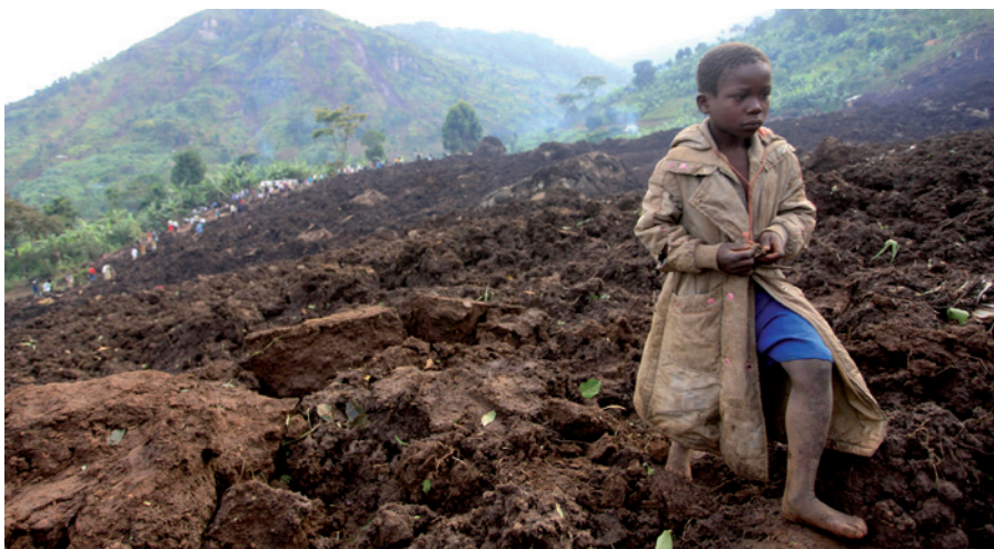
When a landslide in Bududa, Uganda, in 2010 wiped out homes and families, the Ugandan government advised people to evacuate.

Institutional and legal systems remain ill prepared for managing relocation in response to climate threats. For example, the US Federal Emergency Management Agency, which provides federal aid for preparing for disasters and for relief and recovery after them, has little power to manage pre-emptive resettlement. It can support community relocation only once disaster strikes, and only in response to a handful of hazards — including