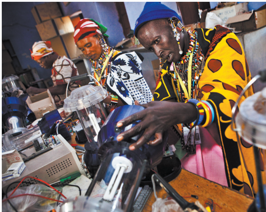
Masai women from Kenya take a course on solar energy in India.