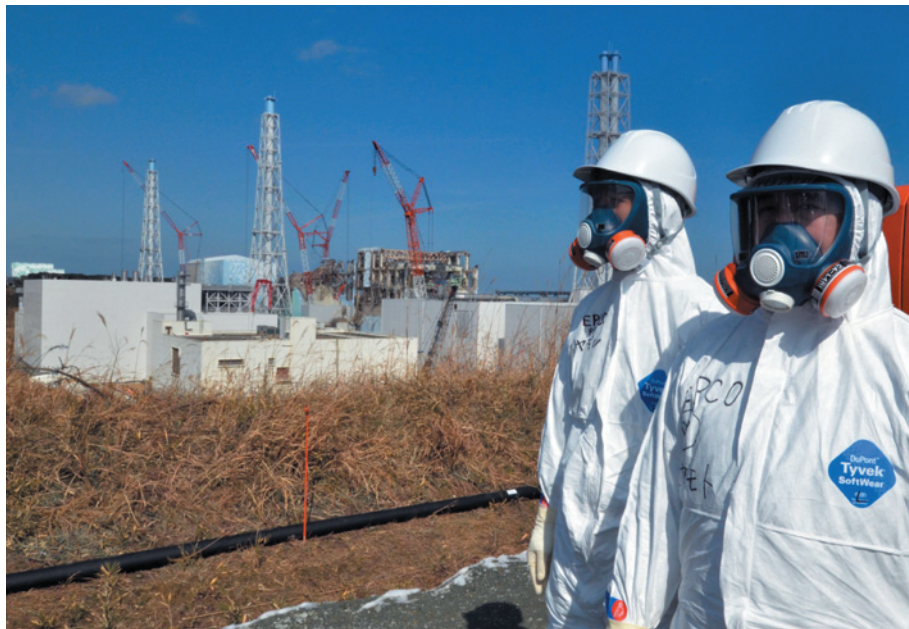
Around 170 of Fukushima's workers have a slightly elevated risk of cancer due to their radiation exposure.