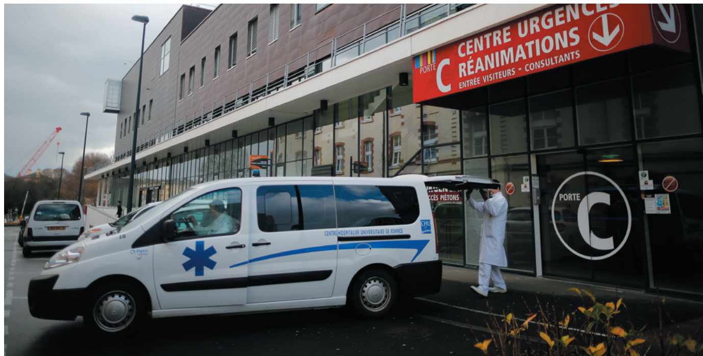
The hospital in Rennes, France, to which six people were taken after suffering adverse effects in a phase I clinical trial.