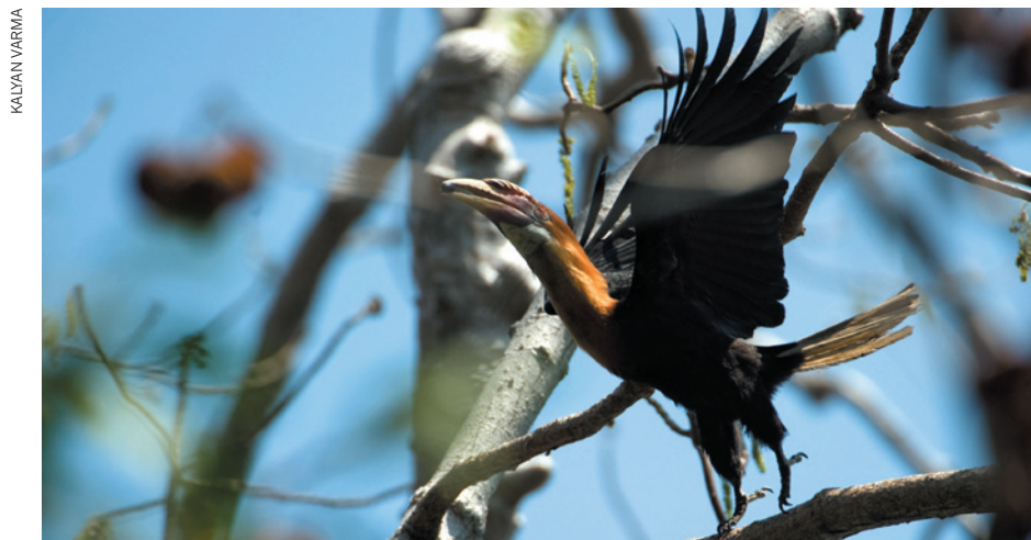
The Narcondam hornbill ( Aceros narcondami ) is found only on Narcondam Island in the Bay of Bengal.

— companies can choose who will do their EIAs.