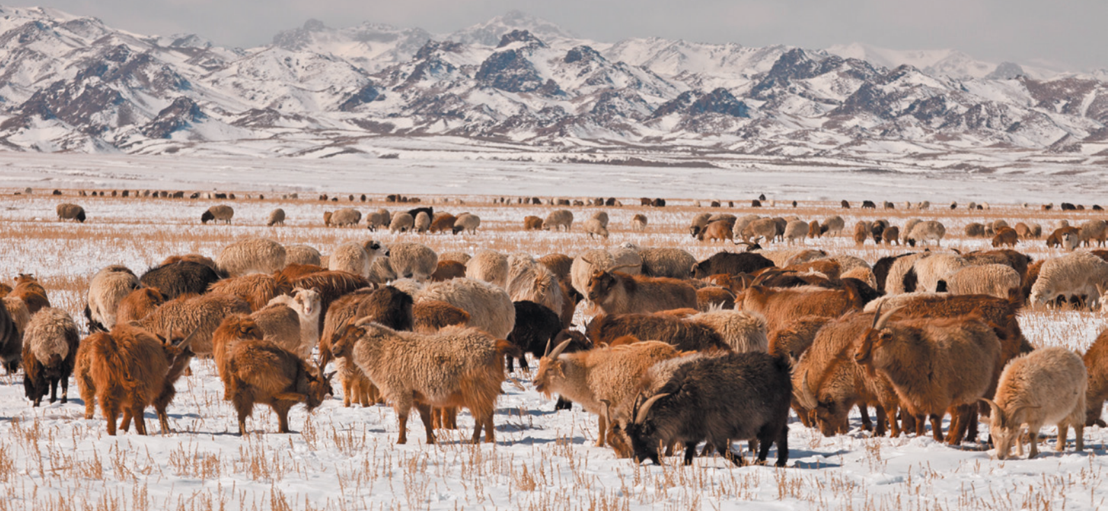
Domestic goats and sheep can graze marginal lands, such as those in the Gobi Desert in Mongolia.