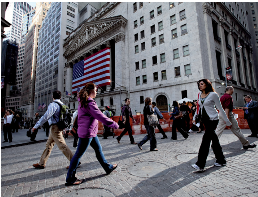
The United States has the right amount of genetic diversity to buoy its economy, claim economists.

The paper argues that there are strong links between estimates of genetic diversity for 145 countries and per-capita incomes, even after accounting for myriad factors such as economic-based migration. High genetic diversity in a country's population is linked with greater innovation, the paper says, because diverse populations have a greater range of cognitive abilities and styles. By contrast, low genetic diversity tends to produce societies with greater interpersonal trust, because there are fewer differences between populations. Countries with intermediate levels of diversity, such as the United States, balance these factors and have the most productive economies as a result, the economists conclude.