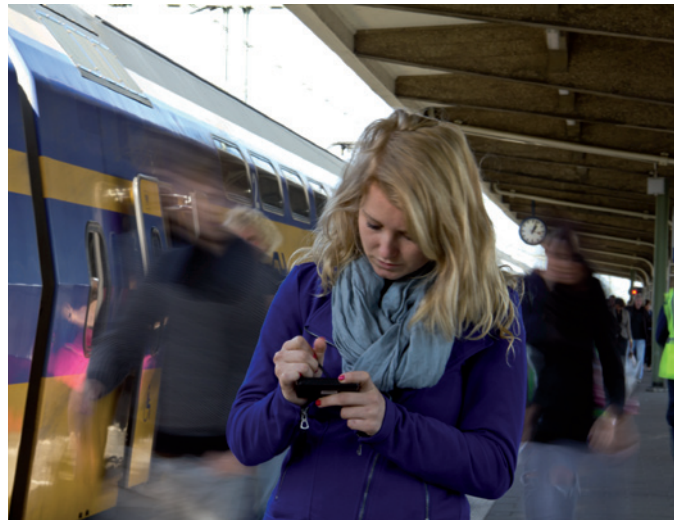
Rush hour: phone apps are helping researchers to survey stress over the day.