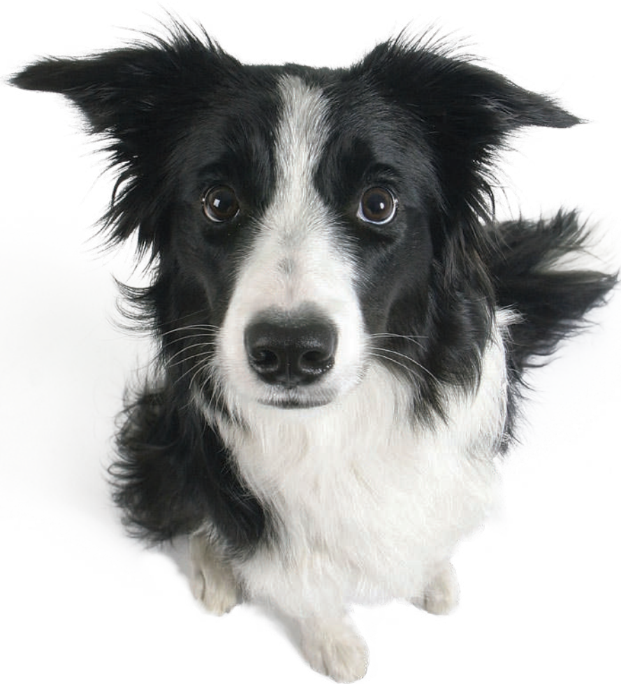
Border-line: can collies help unpick the genetics of anxiety?