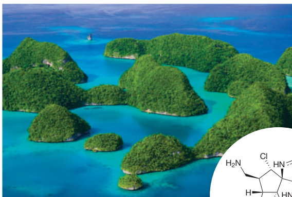
Palau'amine (inset) is found in sponges in the waters around the Republic of Palau.

Palau'amine was isolated from the sponge Stylotella agminata , which is found in the waters around the Republic of Palau in the