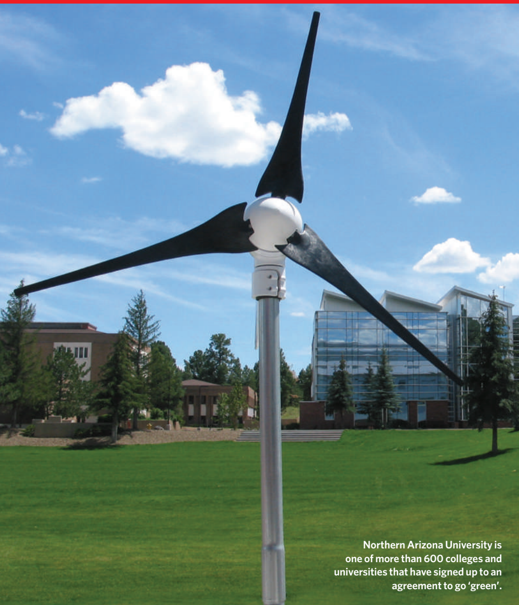
Northern Arizona University is one of more than 600 colleges and universities that have signed up to an agreement to go 'green'.