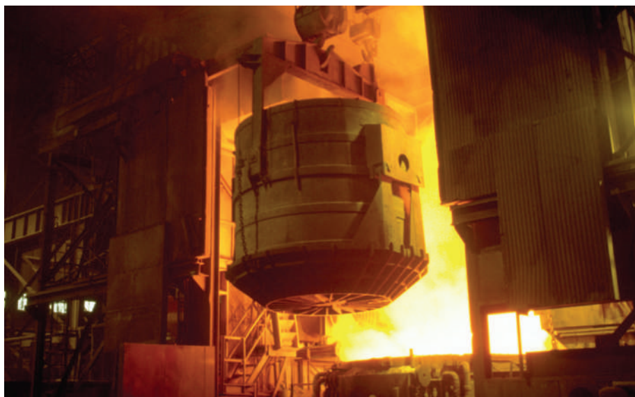
Each furnace used to turn scrap metal into steel could be used to recycle about 15 megawatts of electricity.

“The US system looks like our system did maybe 25 years ago.” — Per Lund