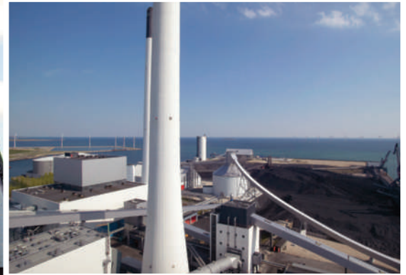
About half of Denmark's electricity comes from combined heat and power plants (such as these in Viborg, left, and Amager) that provide both electricity and heat to houses and offices.