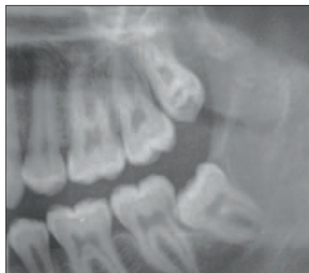
Fig. 1 Dental panoramic radiograph

teeth, complaining of frequent episodes of infection, swelling and irritation associated with an erupted maxillary third molar. Although clinical examination clearly revealed double teeth, radiographic examination failed to accurately demonstrate the anomalous tooth morphology (Fig. 1). The extracted tooth had five separate roots (Figs 2a-c).