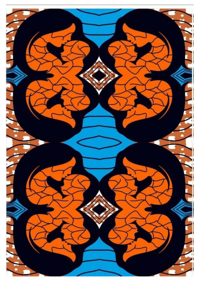
Fig. 4 A communicative African fabric design depicting the mother's love using different shades and tints orange, brown and blue. This figure is covered by the Creative Commons Attribution 4.0 International License. Copyright © Adeloye et al. (2023), all rights reserved.

authentic African print includes only prints of African origin that exclude the contemporary African prints of the wax or batik. The Africans' pride in Africanizing social events using textiles describing African traditions and heritage has become an act of neo-colonialism being promoted indirectly by the Africans themselves to generate wealth for European companies such as Netherlands' Vlisco and Britain's ABC Textiles, which have run the industry for more than three centuries.