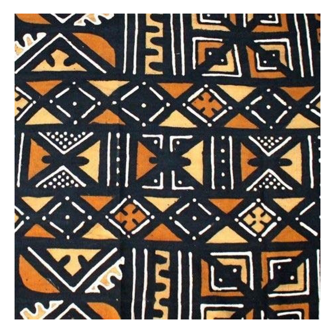
Fig. 3 Malian Bogolan: a traditionally Malian cotton fabric dyed with fermented mud and worn by women during important periods of transition and by male hunters as group identity. This figure is covered by the Creative Commons Attribution 4.0 International License. Copyright ©The University of Wisconsin Libraries. https://researchguides.library.wisc.edu/c.php?g=178217&p=6134212.

scholarship linking the first introduction of the Javanese batik in West Africa to the return of the African veterans from the Dutch colonial army remain widely unjustified. A study by van Kessel (2018) found no evidence in support of the role of the returning veteran soldiers in introducing batik or wax print textiles.