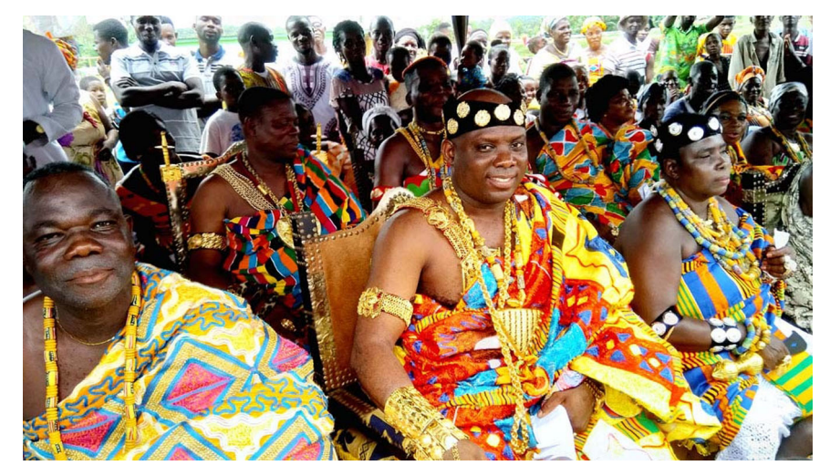
Fig. 5 An aesthetic kente fabric. King of Ashanti Kingdom wearing rich Kente cloth during festival in Ghana. This figure is covered by the Creative Commons Attribution 4.0 International License. https://commons.wikimedia.org/wiki/File:Ashanti_chief_in_Ghana.jpg.

The ruling classes across societies have historically used clothing and symbolic artifacts to demonstrate their power and wealth using some form of sumptuary laws based on their social ranks including wealth and political power to reinforce social stratification and class boundaries (Wilson, 2016; DuPlessis, 2019). In Ghana for example, Akinbileje (2014) observed that kings and chiefs often wore clothes decorated with gold string patterns and coral beads to communicate their financial strength to the rest of the public including their rivals. This is evident with the colorful Kente cloth shown in Fig. 5, which was worn exclusively by the royals of the Ashanti Kingdom since the sixteenth century as a form of cultural representation of the Ashanti people.