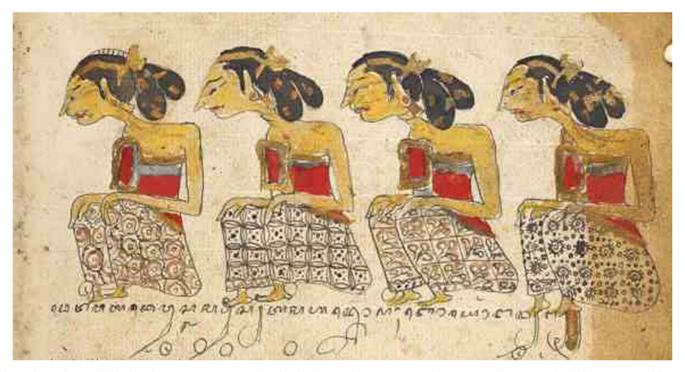
Fig. 1 The earliest Batik designs in a Javanese manuscript showing four captive Javanese princesses wearing symmetrical designs arranged in squares. This figure is covered by the Creative Commons Attribution 4.0 International License. Copyright © British Library, MSS Jav. 89, f. 136r, all rights reserved. https://blogs.bl.uk/asian-and-african/2022/11/batik-designs-in-a-javanese-manuscript-serat-damar-wulan.html.

commemorative textiles in the form of patterns, images, and colors to depict the distinctive character of a specific cultural group or community. These symbols reinforce a sense of collective memory, continuity, and belonging, which helps in conserving and transmitting cultural knowledge from one generation to the next (Bishop, 2014). In Africa, the popularity of textiles is deeply rooted in many cultures, and Sylvanus (2007) called it Africanity, to illustrate a conceptual construction of authenticity in the context of the Western view of the African textile. Willard (2004) observed that African commemorative textiles have become effective means of communicating various social messages to the public during social events such as political rallies/campaigns, funerals, and cultural rituals among others. This practice reveals the materialization of collective community identity and social concerns.