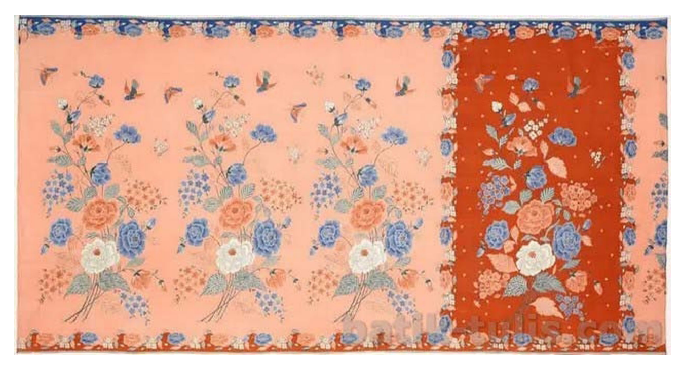
Fig. 2 An Indo-Dutch Batik Design from Elisa Van Zuylen Influenced by the Dutch Culture. This figure is covered by the Creative Commons Attribution 4.0 International License. Copyright © Adopted from Nuraryo (2020), all rights reserved.