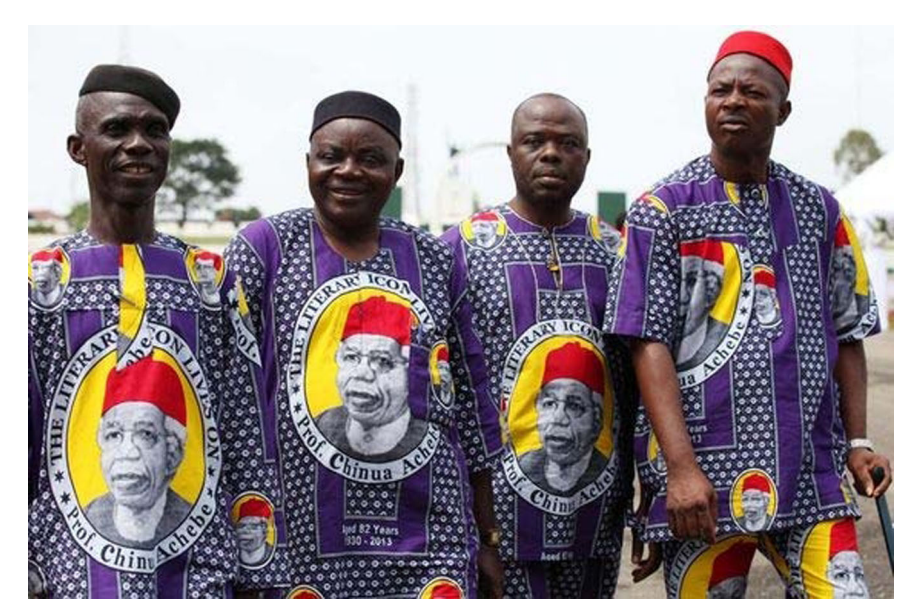
Fig. 8 Mourners dressed in late Chinua Achebe's Commemorative textiles. This figure is not covered by the Creative Commons Attribution 4.0 International License. Copy rights ©Pinterest, all rights reserved. https://pin.it/4mgDRYh.