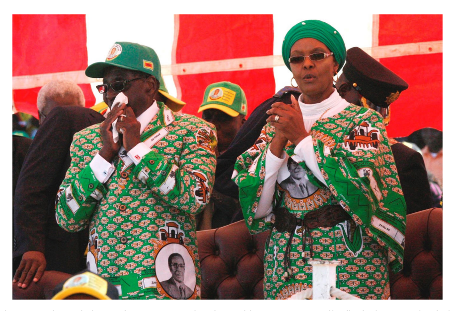
Fig. 7 Late President, Robert Mugabe and First Lady, Grace Mugabe, dressed in ZANU-PF Textile displaying Mugabe during a political event. This figure is covered by the Creative Commons Attribution 3.0 International License.