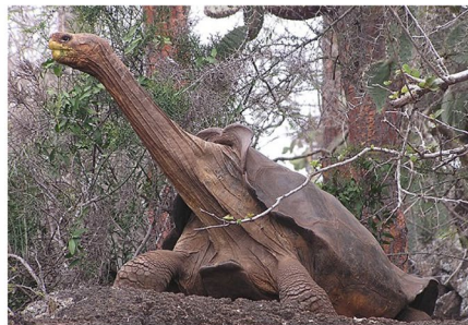
Figure 1. Saddleback (right) and domed (left) shell morphotypes in Galápagos giant tortoises.

been reported in Galápagos giant tortoises<sup>19–21</sup>, its existence does not necessarily imply evolutionary causation, as habitat selection may be a consequence rather than a cause of shell shape evolution.