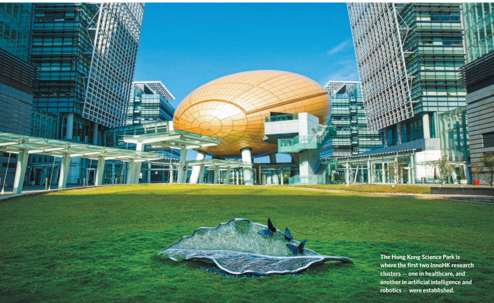
The Hong Kong Science Park is where the first two InnoHK research clusters — one in healthcare, and another in artificial intelligence and robotics — were established.