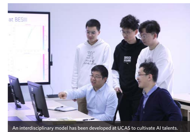
An interdisciplinary model has been developed at UCAS to cultivate AI talents.

students develop a good work-life balance. It also provides basic courses in mathematics and physics, regardless of their future plans for a major.