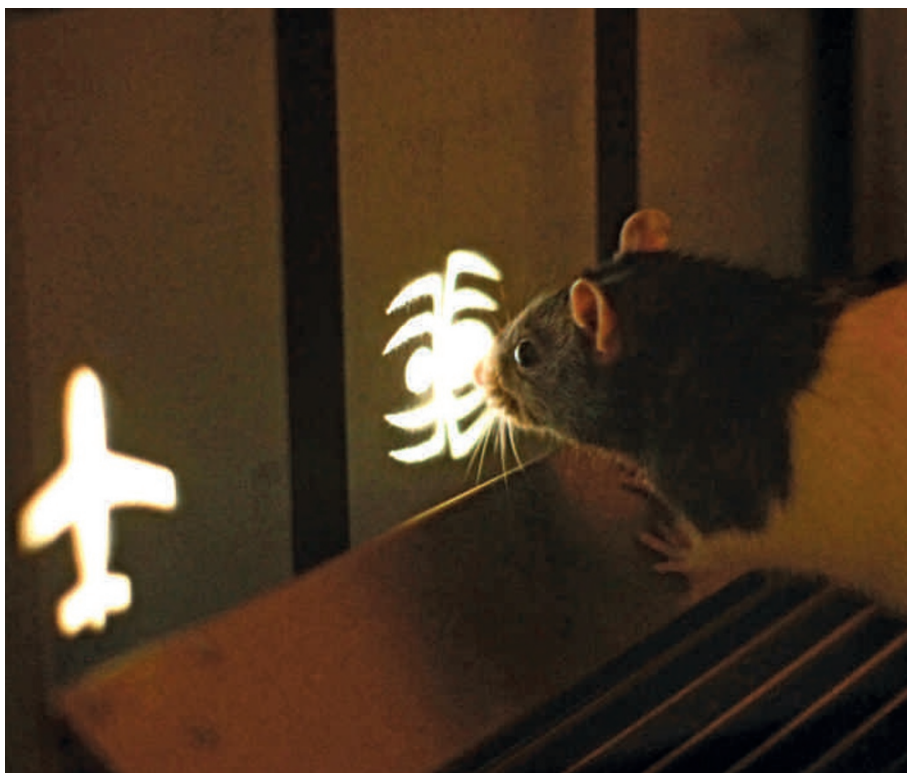
Rodents are used to test drugs designed to correct cognitive deficits in people with schizophrenia.