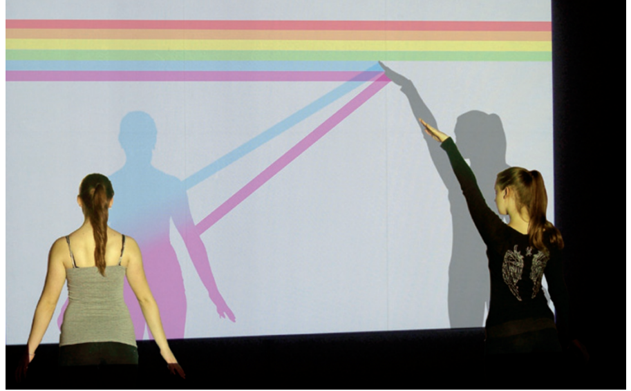
Social Light at the Science Museum in London lets audience members act as mirrors.