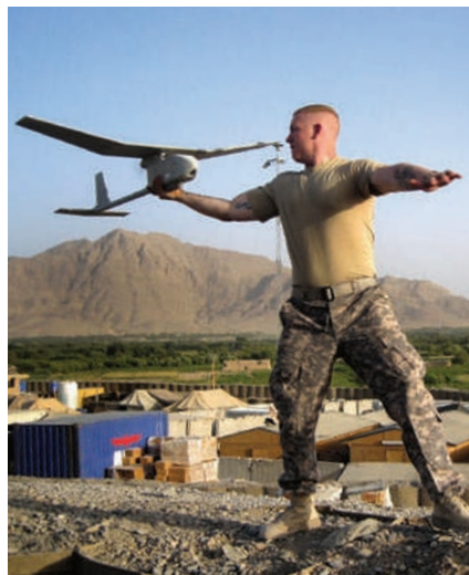
Should military spending account for 58% of the US research and development budget?

pitch for additional funds to support young health researchers is likely to be favourably received. The extraordinary doubling