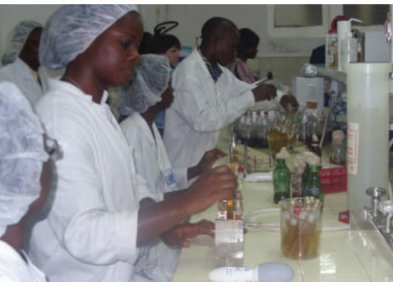
The number of accredited labs in Africa may rise.

For a longer version of this story, see http://tinyurl.com/kuav82