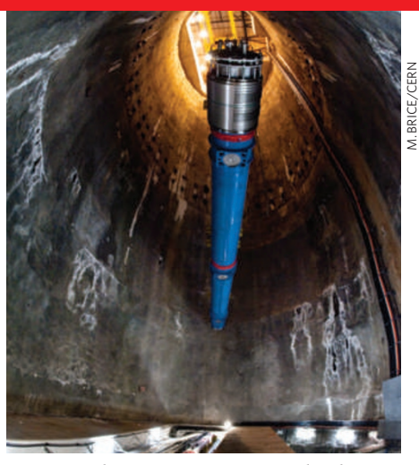
A superconducting magnet is removed at the LHC.

With a short technical stop over Christmas, the LHC will run through to autumn 2010, but it will accelerate its protons to just 5 teraelectronvolts (TeV),