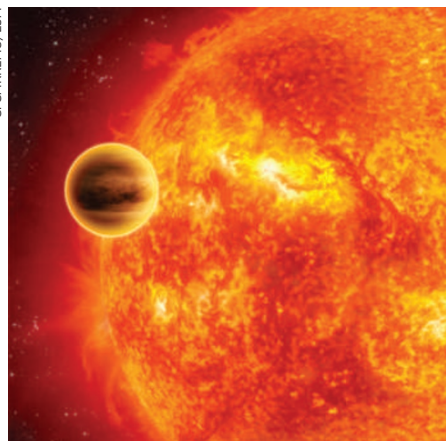
An artist's impression of planet HD 189733b.

The observations were made using the NICMOS near-infrared camera on the