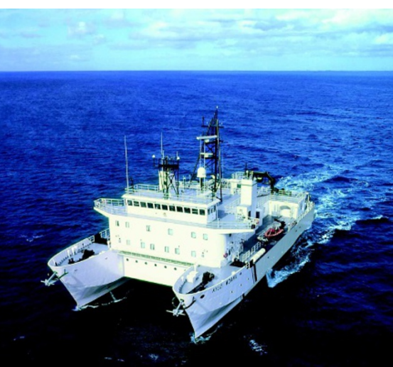
Some of the US research fleet may be suspended.

US secretary of state Condoleezza Rice was to have sealed the deal on a visit to New Delhi last weekend. As Nature went to press, President George W. Bush was expected to sign the deal on 8 October.