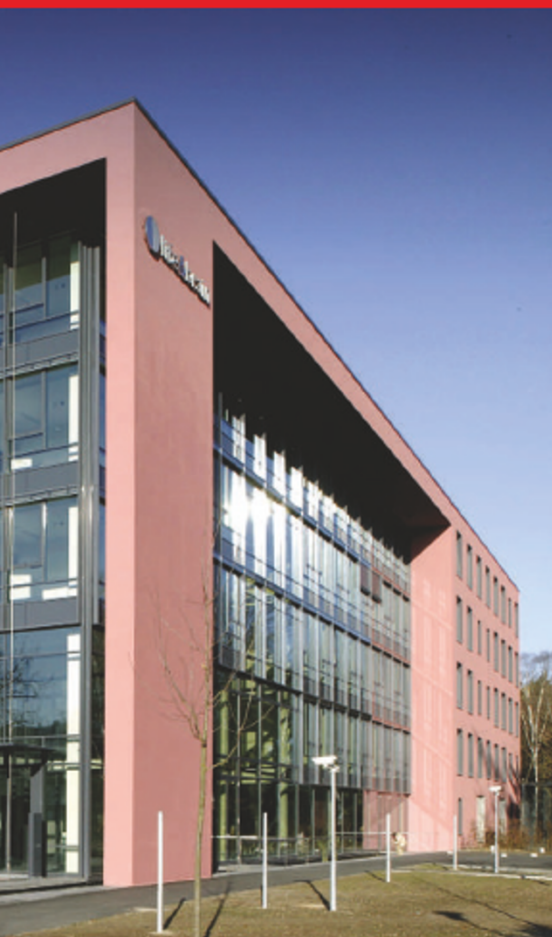
Revolving doors: Life & Brain's home could act as a gateway between academia and industry.

revolving door between academia and business, arguing that universities cannot usually hold positions open for professors wishing to spend a few years in commerce. "The way the German system is now, it will not work except for maybe a few very excellent people," he says.