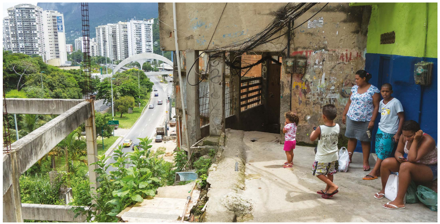
In Rio de Janeiro, Brazil, residents in unplanned settlements live just blocks away from wealthy suburbs.